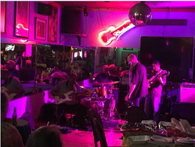
Setting up at The Note Lounge