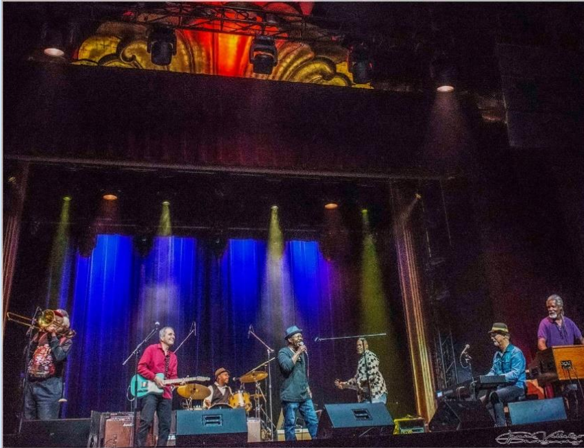
Photo of Wee Willie Walker's last performance with Anthony Paule at The Empress Theater in Vallejo, CA