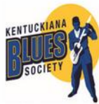
Kentuckiana Blues Society (Kentucky)

Click HERE to learn more about The Keeping The Blues Alive Award