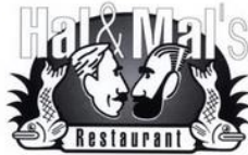
Hal & Mal's (Mississippi)