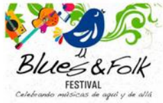
Cali Blues & Folk Festival (Colombia)