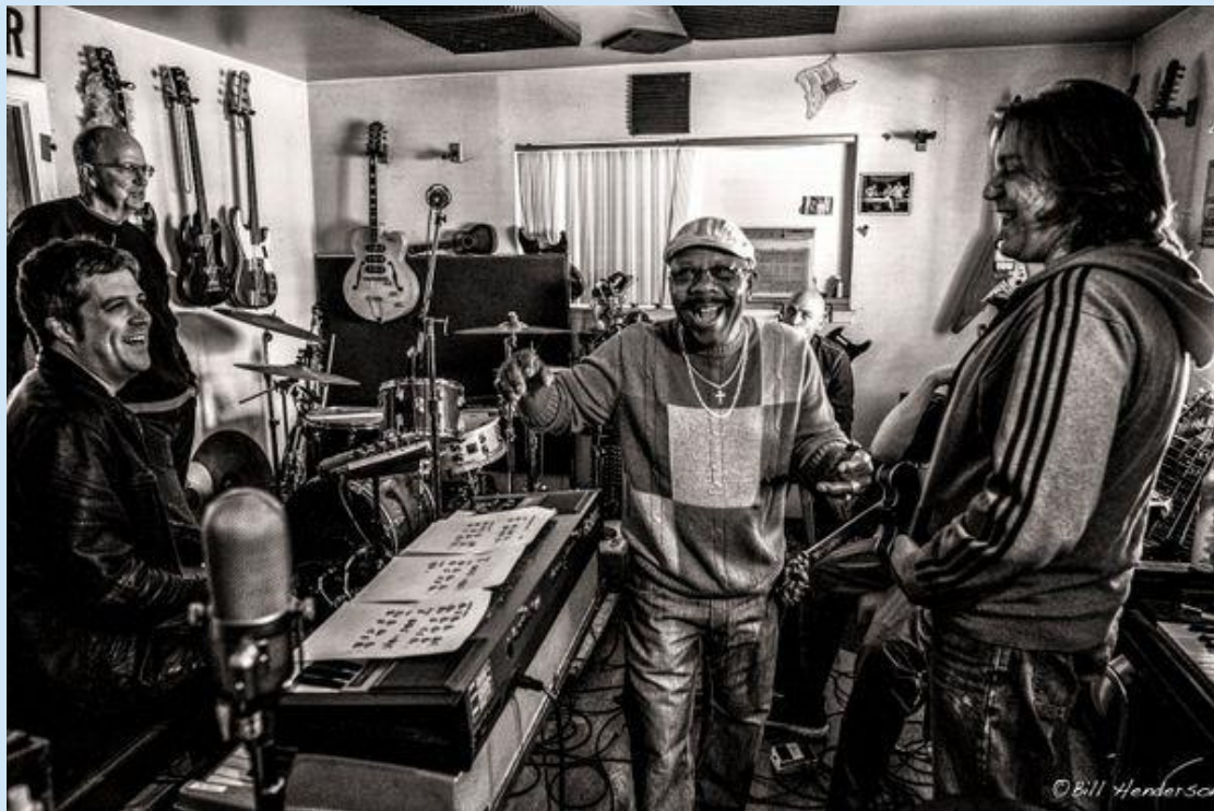
Photo above was taken at Greaseland Studios in San Jose, CA